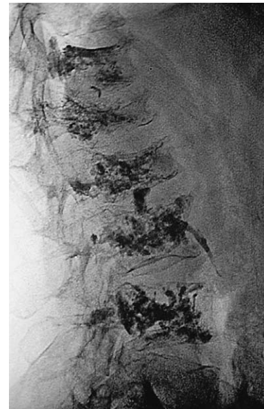
Fig. 3. Postoperative x-ray.

All patients underwent vertebroplasty. The patient was placed in a prone position (significant kyphosis correction was achieved and the height of the collapsed vertebral body was increased by up to 10%). The fractured vertebra was located with an image intensi-