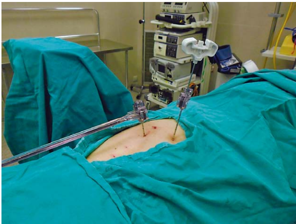
Fig. 2. Bone biopsy.

vertebroplasty at the Department of Orthopedics, Osijek University Hospital Centre in the last ten years. Based on the medical documentation available, the following general data were analyzed: gender, duration of the illness, level of pain before and after the surgery (VAS), radiological changes in the operated segment before and after the procedure, especially the grade of fracture, and existence of extracorporeal leakage of cement during the procedure. VAS is the most commonly used scale for measuring pain intensity. Patients filled out a questionnaire immediately before the procedure and three weeks after it. Vertebral body angle of inclination was measured before and after the procedure by latero-lateral radiograph (Fig. 1).