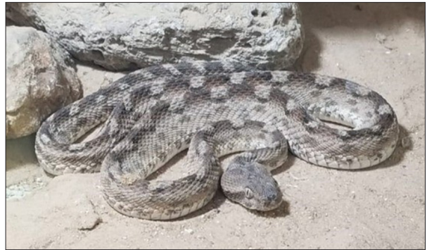
Figure 5. Photo of Echis coloratus , courtesy of Dr Mohamed Obeidat [11].

The WHO guidelines for the management of snakebite envenomation emphasize essential clinical roles: patient assessment