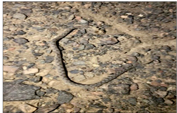
Figure 1. Snake photo provided by the patient's relative.

An 18-year-old man with an unremarkable past medical history presented to the Emergency Department (ED) with a snake