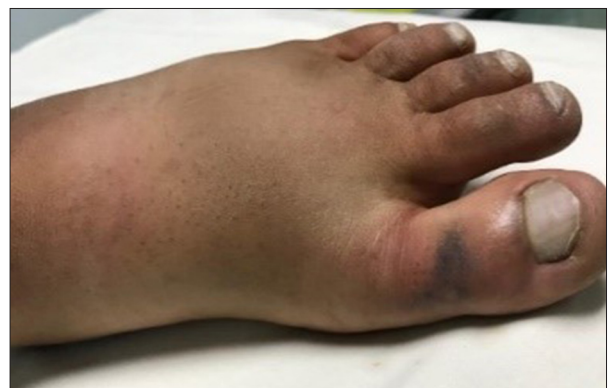
Figure 2. Bitten limb on admission.

bite injury on the back of his left big toe that had occurred 30 min before presentation. The photo of the dead snake was provided by the patient's relative (Figure 1), who endorsed it as "Al Raqtaa", a local synonym for Vipera palestinae , which was neither a member of the snake fauna in Saudi Arabia nor included in the spectrum of activity of the local anti-snake venom (ASV). The patient reported a prickling pain at the bite site without any other associated symptoms. Upon examination, he was fully conscious, oriented, hemodynamically stable, and afebrile. No hematological symptoms were reported aside from a dark blackish hematoma on his left big toe. His foot was red and swollen up to the ankle (Figure 2). Both lower limbs were warm to the touch, with intact peripheral pulses.