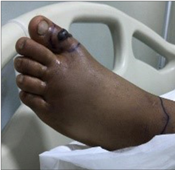
Figure 3. Bitten limb on day 5 of admission.