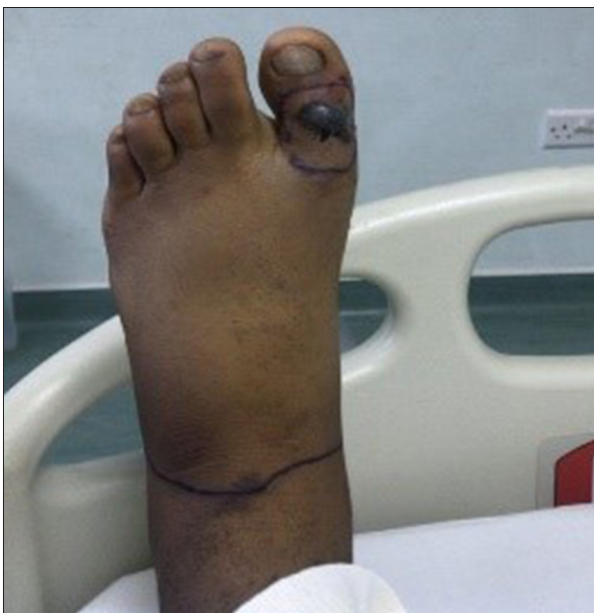
Figure 4. Bitten limb on day 6 of admission.

Following patient discharge, a local snake expert identified the snake by the chess-like pattern on the body to have been an Echis coloratus , a common species in the southwestern region of Saudi Arabia (Figure 5) [12]. The venom of this species could be neutralized by the local ASV, which explained the patient's response to the treatment.