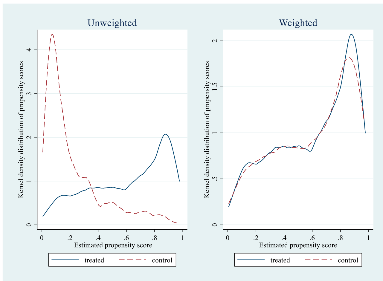
Figure 1 The kernel density distribution of propensity scores between the insured (treated) and the uninsured (untreated).

region of common support before matching, while the weighted figure show that the groups look more similar after matching. This provides evidence that running Equation (1) without propensity score matching would result in biased estimates.