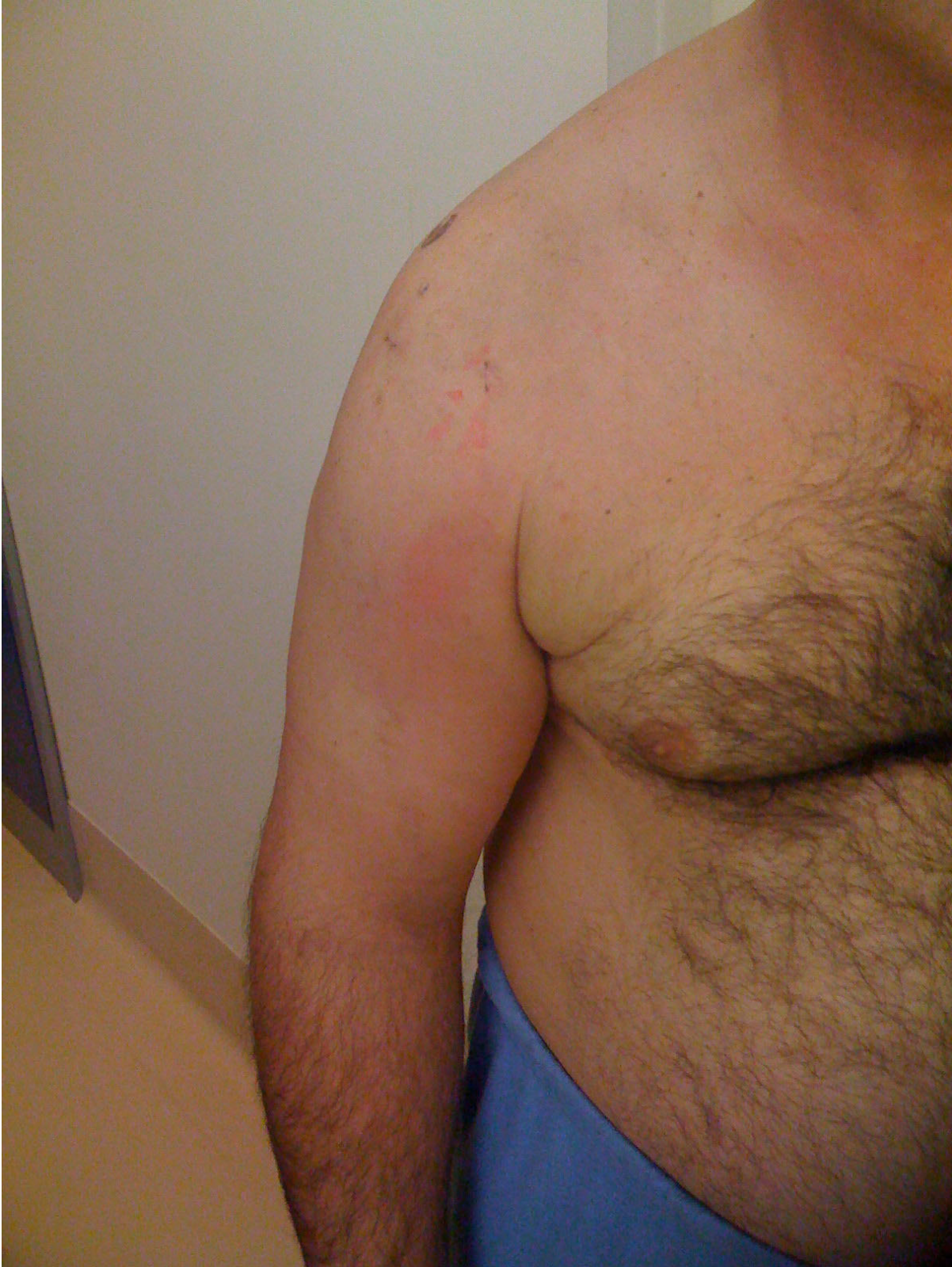
Figure 2 Clinical examination 4 weeks after the shoulder arthroscopy procedure shows severe swelling of the upper right arm and axillary region.