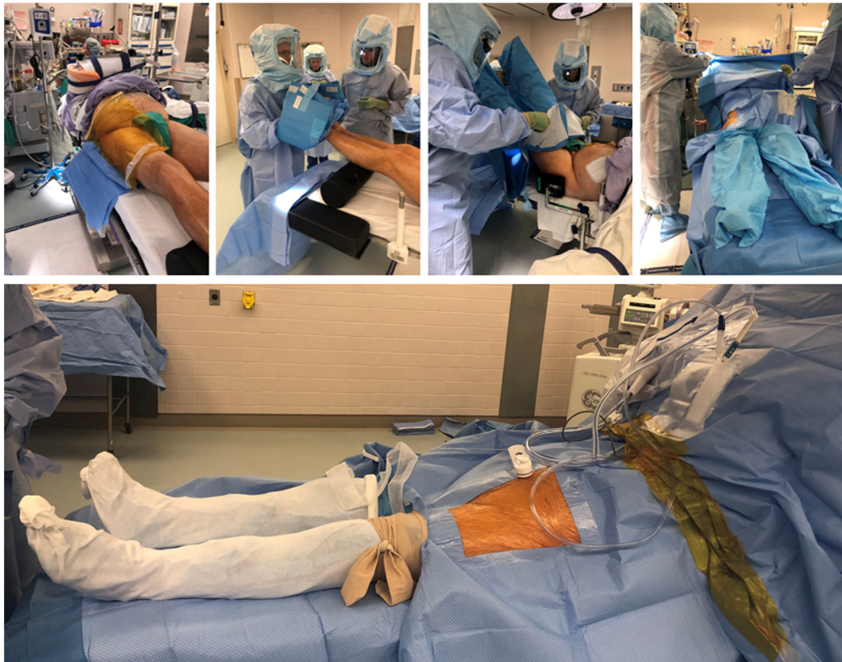
Figure 2. Final positioning and draping for “off-table” hips. The operative side arm was padded in foam and hung from an ether screen mounted on the nonoperative side of the bed. Pantaloons style drapes with an anterior window were utilized. Stockinettes were rolled over each leg to tighten the drape, facilitate manual traction, and to make checking leg length easier. Finally, an ACE wrap (3M Two Harbors, MN) and Kerlix gauze (Cardinal Health Dublin, OH) were used on the operative and nonoperative legs, respectively, to help hold retractors.

Orthopaedics—Physician Advisory Board; and is a board member of AAHKS.