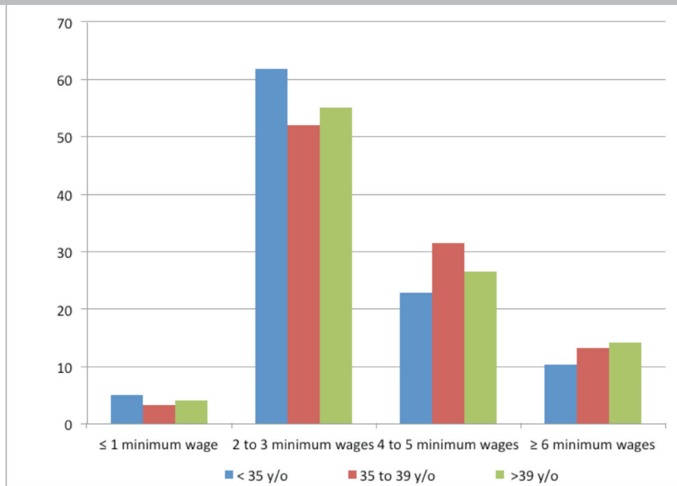
Figure 3. Relationship of couples seeking assisted reproduction treatment through the public healthcare system in each group of women, broken down by age (< 35; 35 to 39 years; and > 39 years) according to family income.

The overall loss of fertility in women was mainly relat-