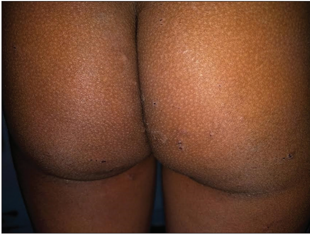
Figure 2: Excoriated gluteal papules