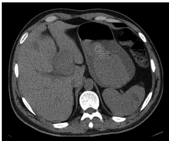
Figure 1. Unenhanced CT demonstrating blood in the gastric lumen with density of 54 HU.

A duodenal ulcer that was 3×3 cm in diameter in the duodenal bulb was detected in upper gastrointestinal endoscopy and the gastric lumen was full of blood. After endoscopic sclerotherapy, the case did not reveal any bleeding sites or sources.