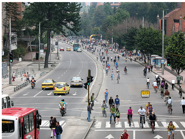
Fig. 2 Active streets during La Ciclovía in Bogotá

city's most famous exports. Ciclovías have sprung up in numerous South American countries as well as cities in Canada and the United States.