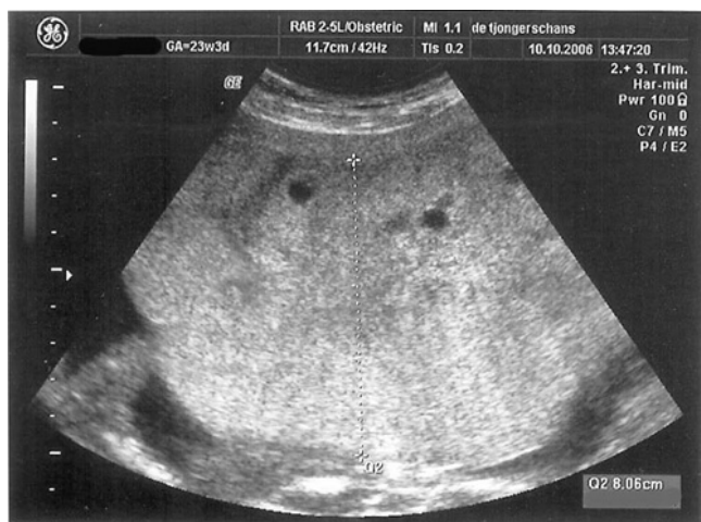
Figure 1. Placenta at 23 weeks.

3 × 250 mg was initiated to control the blood pressure with good result (Figure 2). Blood analysis showed no signs of hemolysis, elevated liver enzymes, low platelets (HELLP) syndrome. At 38 weeks, a cesarean section was performed for fetal distress. A healthy girl weighing 2,710 g was born with Apgar scores of 9 and 10 at one and five minutes, respectively. The placenta of the triploid fetus was necrotic and as a result of autolysis, no further histologic information on fetus and placenta were available. \beta -hCG follow-up showed no signs of persistent