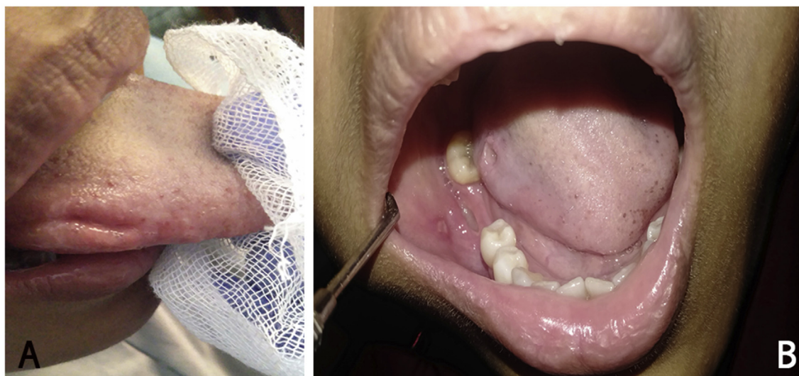
Figure 1: The oral ulcer in the lateral side of the tongue.

Extraoral examination, on palpation, showed that the submandibular lymph node was soft and palpably able to move. The intraoral examination revealed a solitary ulcer, 2 × 5 mm in size, the base of which was yellowish-white with a clear boundary, regular border, elevated induration, hard palpation around the lesion, and pain (Wong–Baker Scale score 2).