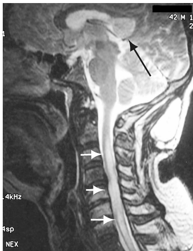
Figure 2 Acute disseminated encephalomyelitis: T2-weighted image obtained in a 42-year-old patient admitted to the ICU for bilateral diaphragmatic palsy 8 days after an acute myelopathy. Spinal cord hyperintensity and swelling involving more than 3 segments (white arrows). Corpus callosum hyperintensity and swelling (black arrow).

phase then increasing in the chronic stage. 20 For some authors, decreased initial diffusion may lead to a poor prognosis. 21 Proton MR spectroscopy may show a non-specific progressive NAA/choline ratio decrease. 20