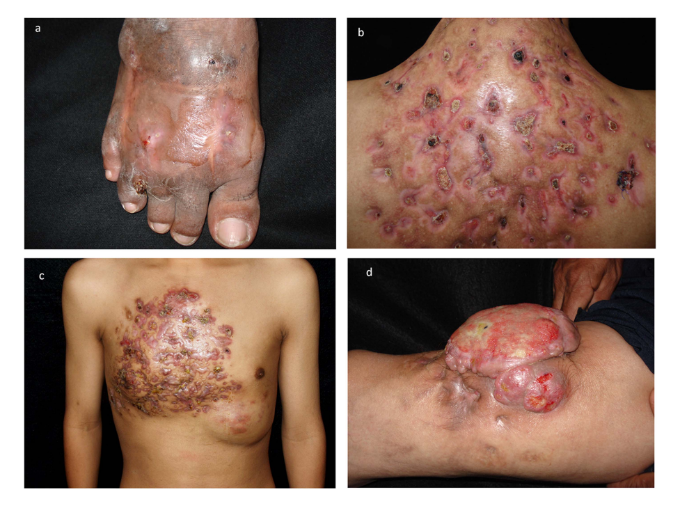
Figure 3. a) Foot mycetoma due to A. madurae. b) Back mycetoma with multiple sinuses caused by N. brasiliensis. c) Extensive mycetoma in an adolescent due to N. brasiliensis. d) Exophytic or tumoral mycetoma caused by Fusarium solani complex. doi:10.1371/journal.pntd.0003102.g003