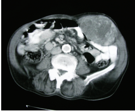
FIGURE 1: The abdominal CT demonstrates a 11 × 7 cm mass in diameter arisen from the rectus abdominis muscle.