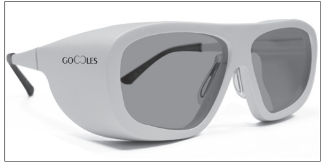
Fig. 1. The GOCCLLES (Glasses for Oral Cancer – Curing Light Exposed – Screening) medical device.

The GOCCLLES ® device (Pierrel S.p.A, Italy) consists of a pair of glasses equipped with filters (Fig. 1) that highlight