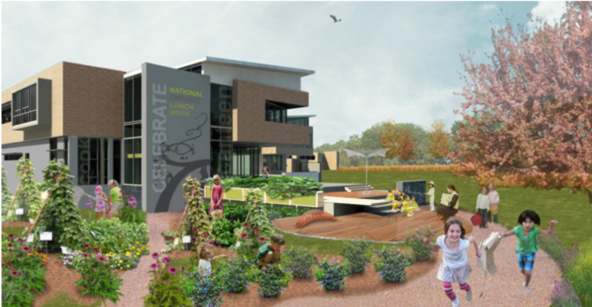
Figure 4. Integrated school garden and outdoor eating spaces for upper and lower elementary schools, Dillwyn, Virginia. [A text description of this figure is also available.]

School architects are increasing their focus on using the building as a teaching tool for developing such perspectives as eco-literacy (23). The Healthy Eating Design Guidelines seek to use the school kitchen, cafeteria, and landscape (Figure 4) similarly to improve the health literacy of children. For example, the co-location of teaching and commercial kitchens equips the cafeteria for educational programming on initiatives such as student- and teacher-produced fresh foods. The kitchens facilitate community outreach by providing a well-equipped and inviting environment for hosting off-hour community education on nutrition, cooking skills, and other food-related topics.