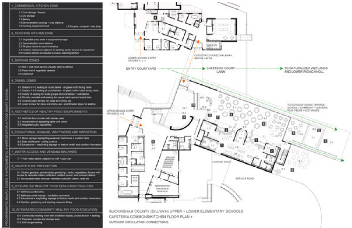
Figure 2. Floor plan for the cafeteria and kitchen for upper and lower elementary schools, Dillwyn, Virginia. [A larger copy of this figure with text description (PDF – 1.8 MB) is also available.]