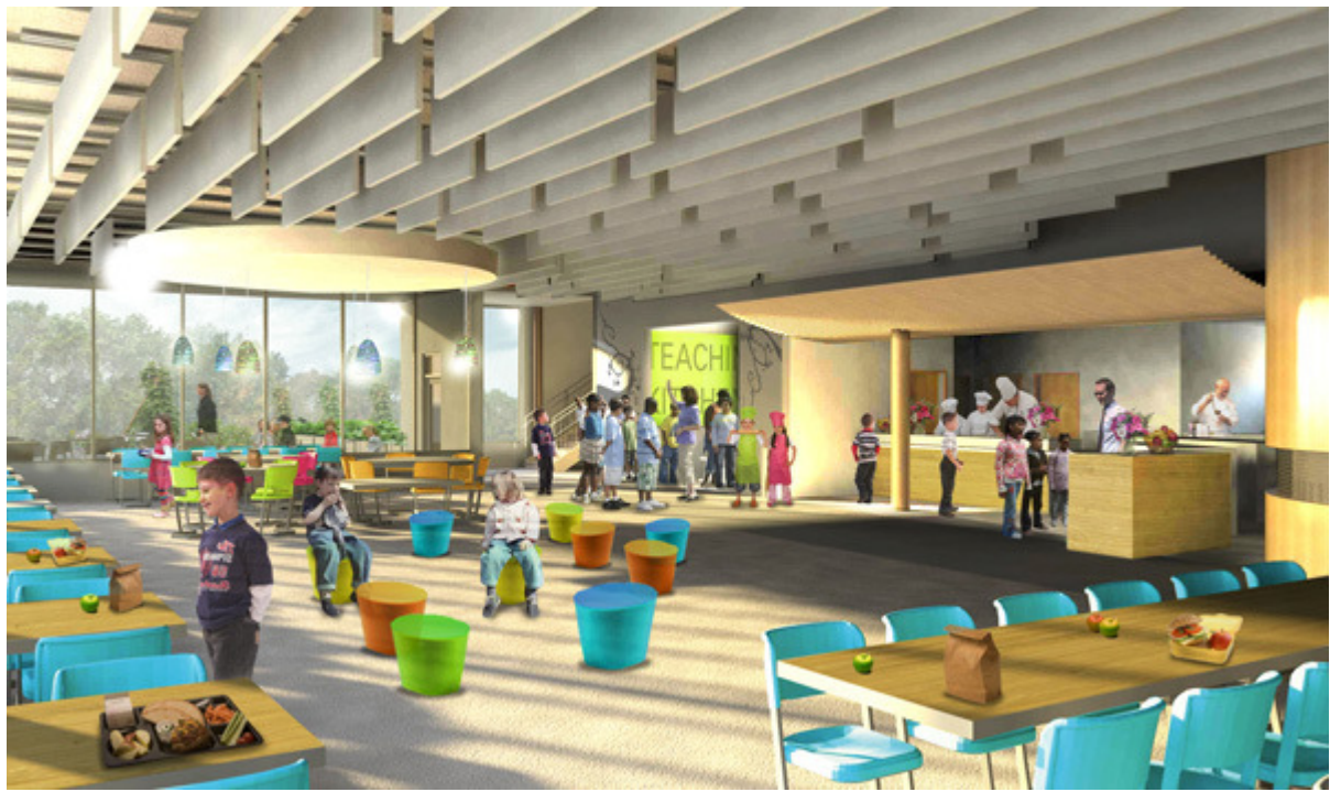
Figure 3. Artist rendering of open kitchen and co-located teaching kitchen for upper and lower elementary schools, Dillwyn, Virginia. [A text description of this figure is also available.]

The collaborative research and design process relied on 5 elements: