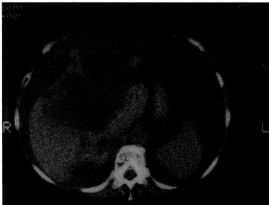
Figure 2 CT scan showing caudate lobe hypertrophy (CL).