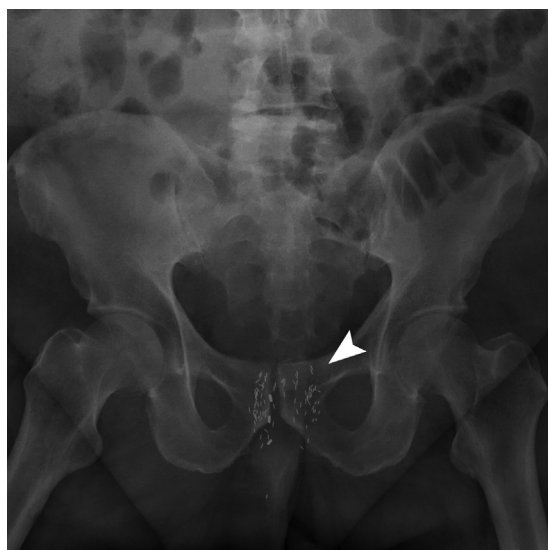
Fig. 3 – Thick maximal intensity projection series derived from a CT Urogram of the prostate shows prostate seeds in situ (different patient). The arrow indicates the location of the brachytherapy seeds.

There are sparse reports of unusual sequelae of seed migration. Single examples of radiation pneumonitis, acute myocardial infarction, and small-cell lung cancer associated with seed migration to the thorax have been reported [5–7]. Migration of seeds directly into the parenchyma of the right ventricle, as with the case detailed herein, has been reported and proven previously at autopsy, although rare [2]. Most concerns of these reports are related to fear of secondary malignancy or mortality from the radiation effect and embolization, respectively. However, a number of convincing