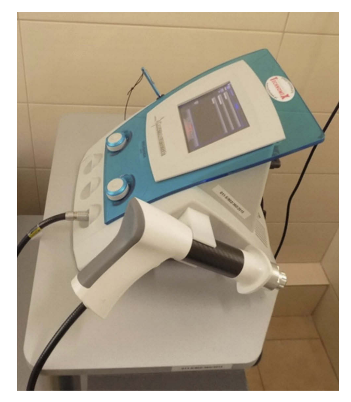
Figure 2 The rESWT device used in the study.

Patients from group A were treated with rESWT using a Pro-Shock Waves pneumatic device (Cosmogamma, Indonesia; see Figure 2). Each treatment was performed using a contact method, with the labile movement of the applicator (head) in the spinal region at the level of the lumbar and sacral spine in the area of the most severe painful ailments reported by the patient (Figure 3). The following treatment parameters were used: 2000 pulses with the pressure of 2.5 bars (corresponding to an energy flux density of 0.1 mJ/mm<sup>2</sup>), 5 Hz frequency, and treatment time of seven minutes. A standard ultrasound gel was used to connect the applicator head to the skin, reduce tissue resistance, and maintain proper coupling and