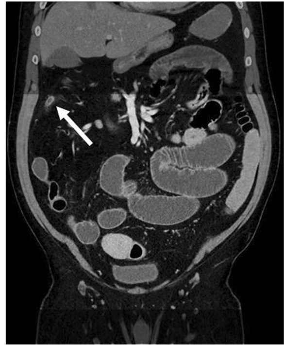
Fig. 4 Coronal reformatting CT of a patient with acutely inflamed unusual high positioned appendix as an example for another marginally displayed finding in reduced range CT

Our study has limitations. First, it is a retrospective single-center study with limited sample size. The included CT examinations were conducted on different scanners with different reconstruction methods (different strengths of iterative reconstruction or filtered back projection), and the used contrast agent protocols were not uniform as a minority of examinations were performed with rectal contrast or without intravenous contrast. However, we investigated the impact of a shorter scan range which is independent of the used CT protocol. Furthermore, we do not have surgical or clinical confirmation of the diagnoses made by CT, but this was not the purpose of our study as we did not examine the accuracy of CT in patients with acute abdominal pain which has been done before. Despite the fact that the use of CT may cause concern especially in younger patients due to the associated radiation exposure, our cohort with a mean age of about 57 years does not quite