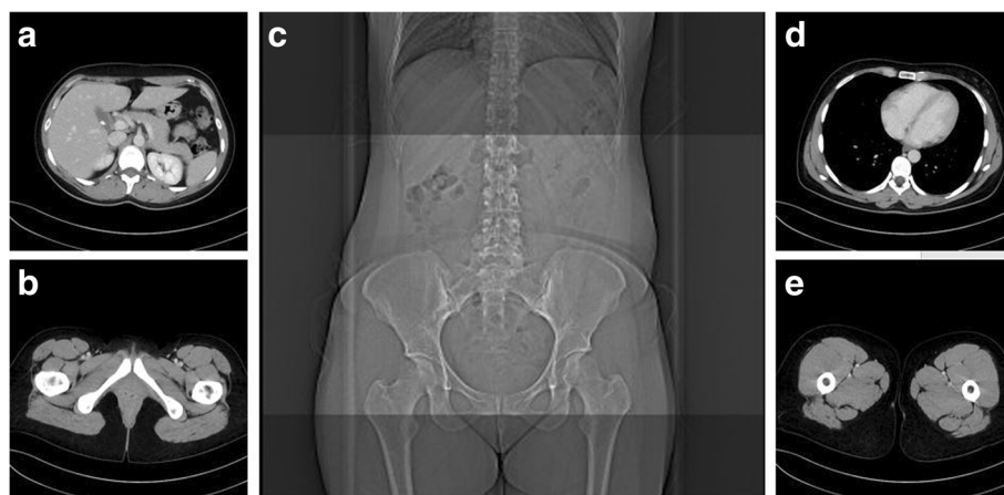
Fig. 1 Axial reconstructed images displaying the upper and lower border of reduced range CT ( a and b ) as defined by the top of L1 and the pubic symphysis ( c ) compared to those of full range CT ( d and e )

The whole body effective dose of the virtual reduced range CT was significantly lower compared to full range CT yielding a dose reduction of 39.2% ( 4.5 [1.9-11.2] vs. 7.4 [3.3-18.8] mSv, p \leq 0.001 ). A remarkable dose reduction