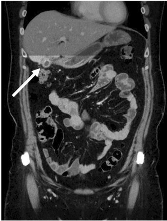
Fig. 3 Coronal reformation of a CT examination of a female patient performed due to suspected acute appendicitis revealing acute cholecystitis, a finding which is marginally displayed by reduced range CT

in which alternative diagnoses were identified more frequently than acute appendicitis [16]. However, in contrast to our work, the patient cohort included in this study did not undergo sonography prior to CT which may rule out or raise the suspicion of common alternative diagnoses like urolithiasis, cholecystitis, small bowel obstruction or adnexal masses in females.