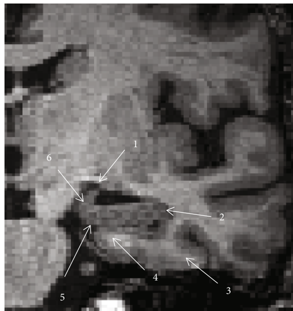
FIGURE 2: A detailed view of left mediotemporal structures on the optimal slice of brain MRI. Anatomical structures are labeled as follows: 1: hippocampal fimbria; 2: alveus; 3: parahippocampal gyrus; 4: subiculum; 5: hippocampal fissure; 6: uncus of the parahippocampal gyrus.

2.6. Normalization of Hippocampal Volume Measurements. The absolute volume of the hippocampus as well as total intracranial volume (TIV) in \text{cm}^3 was obtained by automated brain segmentation using FS (version 6.0 for Linux) [14, 15].