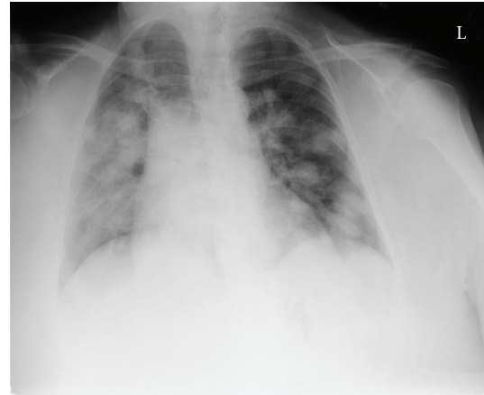
FIGURE 1: Chest X-ray showing multiple pulmonary nodules.

The staple of TLS treatment is prevention. Unfortunately, this is unavailable when presented with a case of spontaneous TLS. The first step in managing hyperuricemia is adequate hydration. Patients should receive 2 to 4 times the daily fluid maintenance unless there are contraindications to large fluid volumes from other comorbidities. The increased urine output should help with excretions of uric acid and phosphate [9, 10]. The general consensus is that the urine output should be above 100 mL/m 2 /h [10, 11]. If the urine output is still inadequate despite hydration, the use of