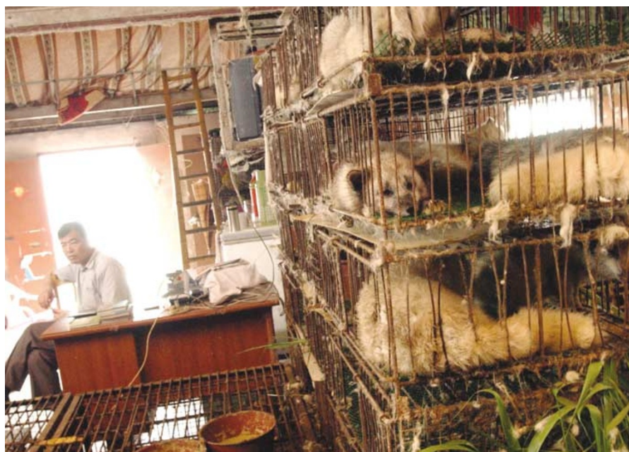
Animals on sale in Guangdong's markets are offering leads to possible sources of the SARS virus.

The relatively high number of positive results is unusual, the experts said. Normally just one main and a few secondary reservoirs would be expected. "These results call into question the specificity of the tests," says François Moutou, head of the French food-safety agency's epidemiological unit and a member of the group. "It would be unusual if species as diverse as mammals, birds and reptiles were all harbouring viruses closely