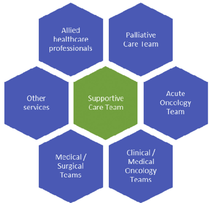
Fig 2. The extended supportive care team

Thus, supportive care needs to be incorporated into the curricula of all healthcare professionals involved in cancer care (including primary care physicians). Appropriate