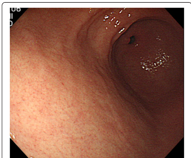
Figure 1 Previous esophagogastroduodenoscopy before starting targeted therapy.

Minor hemorrhagic events are relatively common in patients treated with targeted agents; the most common event reported in patients treated with bevacizumab, sunitinib, temsirolimus, and everolimus is epistaxis, which usually resolves without medical attention. Life-threatening hemorrhagic events are rarer than minor hemorrhagic complications. In the case of bevacizumab, serious hemorrhage appears to be more frequently associated with specific tumor types, such as non-small cell lung cancer or cancer of the gastrointestinal tract [8].