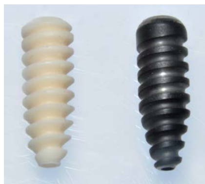
Figure 1. Interference screws: 1) Milagro® 8×23 mm, DePuy Mitek, Raynham, MA, USA and 2) custom made magnesium-based (MgYREZr-alloy) 8×23 mm interference screw.

Sample size determination was performed using an online tool ( www.clinical-trials.de ). The sample size calculation advised 9 specimens per group for a power of 0.8 at a significance level of alpha 0.05. All statistical analyses were performed using Graph Pad Prism (GraphPad Software Inc., La Jolla, CA, USA). Normal distribution was analyzed by the D'Agostino & Pearson omnibus normality test. All values are presented in the form of mean \pm standard deviation (SD). Analysis of variance was used for parametric data and Kruskal-Wallis test for nonparametric data. A P value less than 0.05 was considered to be statistically significant.