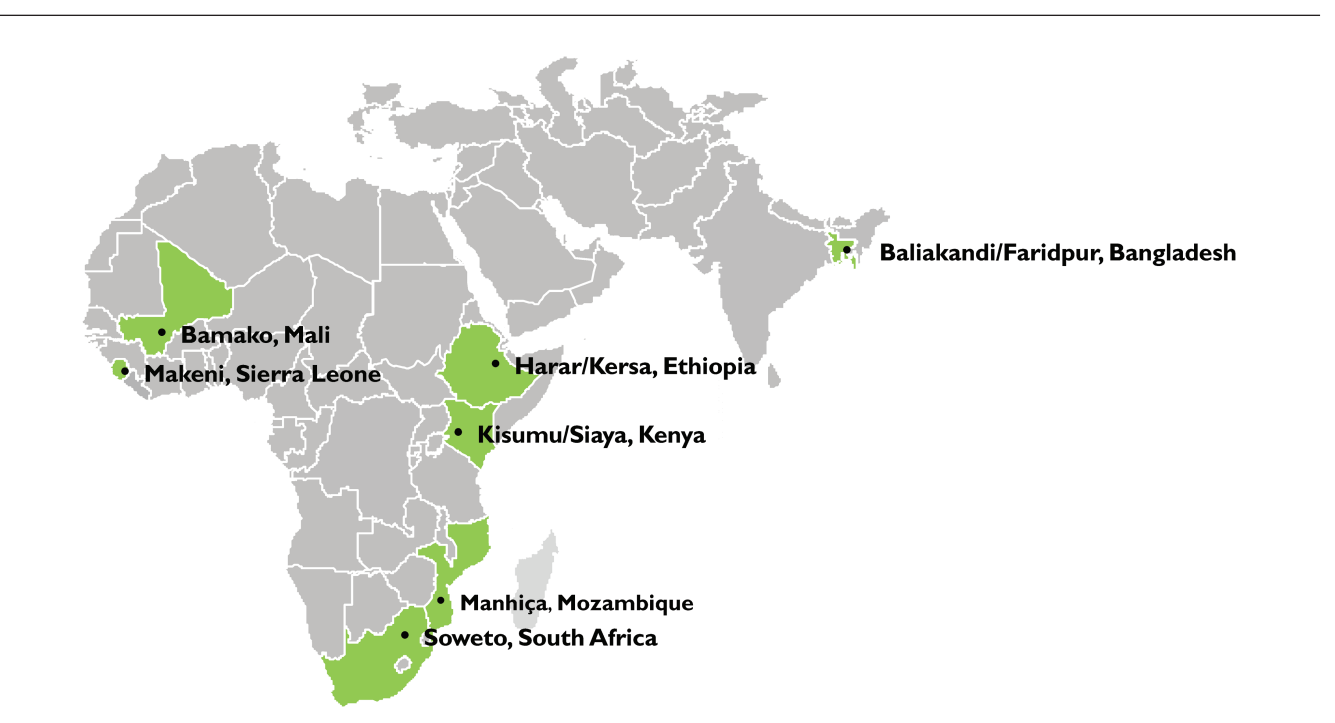
Figure 3. Map of Child Health and Mortality Prevention Surveillance sites. Abbreviation: CHAMPS, Child Health and Mortality Prevention Surveillance.

To monitor demographic trends and calculate mortality rates, most sites conduct surveillance within a health and demographic surveillance system (HDSS). An HDSS