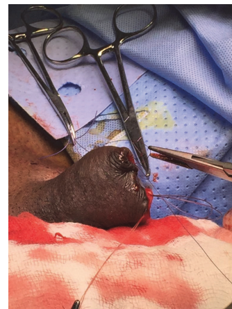
FIGURE 4: Partial penectomy.

and there was no evidence of vitamin D deficiency or thrombophilia. On examination, he had a tight meatus, blackish discoloration of the tip of the glans, and tender hard gangrenous mass of the glans (Figure 1), which was proven to be a calciphylaxis gangrene by histopathological assessment.