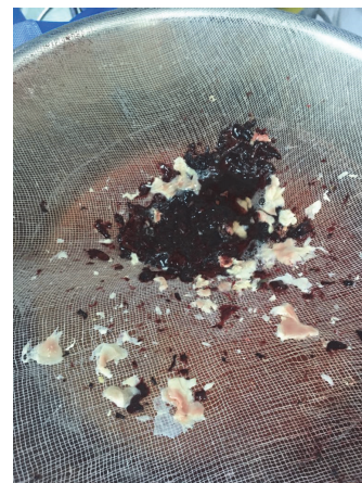
FIGURE 5: Clots and sloughed necrotic tissues evacuated from the bladder.

Conservative therapy was initiated in form of wound debridement, systemic antibiotics and sodium thiosulfate, and tight blood sugar control, but due to severe penile pain we proceeded with partial penectomy (Figure 4). Additionally, a cystoscopy was done and showed sloughed necrotic bladder