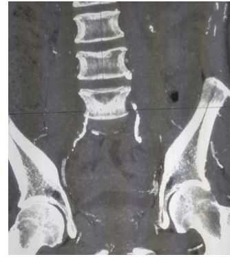
FIGURE 3: Bilateral obstructive calcification of internal iliac vessels.