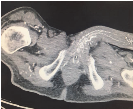
FIGURE 2: Calcification of the penile vessels and tissues.