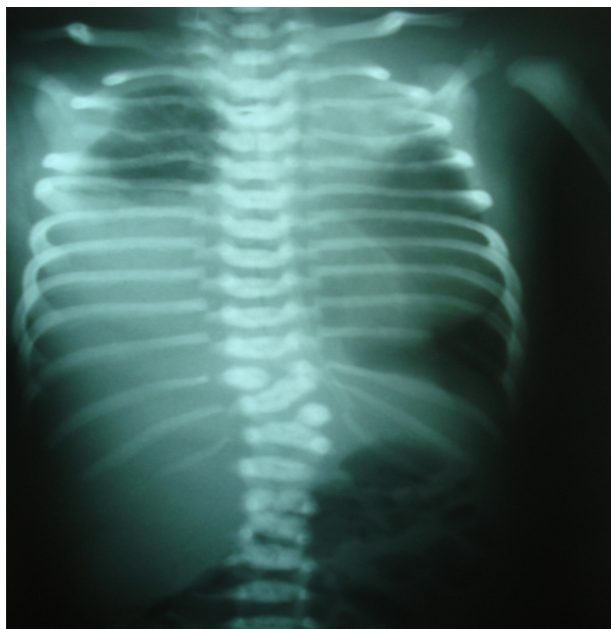
Figure 1 Chest X-ray showing pleural effusion in right pulmonary hemifield.

100 mL of yellow and increasingly opaque fluid (protein 4.5 g/dL, triglycerides 325 mg/dL), and enteral feeding was started. An infectious cause was eliminated. Esophageal opacification was normal. These findings were suggestive of a chylous leak. In view of the lack of availability of parenteral nutrition products in our hospital, oral feedings were started using formula containing medium-chain triglycerides. One week later, the chylous drainage had decreased, and the patient's clinical condition, in particular respiratory status, was gradually stabilizing. Protein losses were replaced and immunoglobulins were given to compensate for antibody loss. The chyle leak had resolved completely ten days later (Figure 2).