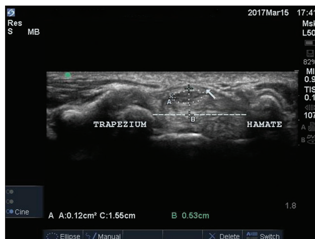
Figure 2: Palmar bowing of the flexor of the retinaculum (solid line) measured by the distance from the palmar apex of retinaculum to a (dashed line) drawn between the tubercle of trapezium and hook of hamate bone. Arrow- flexor of the retinaculum

The results of the measurements of the three sonologists are tabulated in Table 2. There was statistical difference on the measurements of the three sonologists in all the levels except at the level of the forearm. The intra- and inter-tester reliability testing results are shown in Table 3.