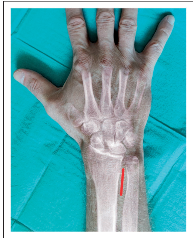
Figure 1. Illustration of the surgical approach for wrist denervation. Red line indicates the position of skin incision just proximal to the distal radioulnar joint (DRU).

The inclusion criteria were symptomatic wrist osteoarthritis caused by scapholunate advanced collapse (SLAC), scaphoid nonunion advanced collapse (SNAC), osteoarthritis after distal radial fracture or osteoarthritis secondary to Kienböck's disease (Table 1). Only patients who had tried non-surgical management, such as bracing, corticosteroid