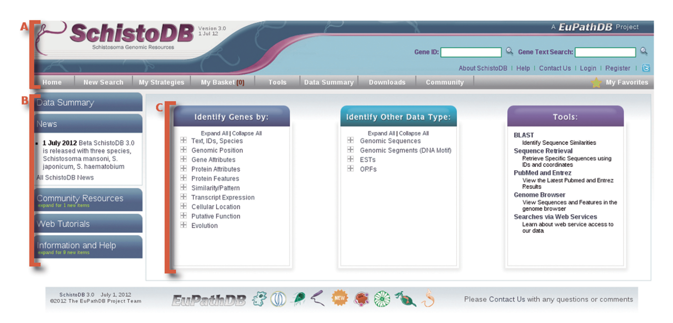
Figure 1. Screen shot of the SchistoDB homepage. (A) The banner section present on all SchistoDB webpages provides links to registration, login, and contact us forms, ID and text searches, information and help, and all available searches and tools. (B) The side panel on the homepage provides expandable tabs that reveal links to a data summary table, community news items, links to community resources, web tutorials and additional information and help links. (C) The central portion of the home page includes all available searches and tools—gene-specific searches, searches against other data types such as genomic sequence, open reading frames and ESTs and tools, such as BLAST, sequence retrieval and the genome browser.

University of Melbourne, the Chinese National Human Genome Center and the Wellcome Trust Sanger Institute, respectively. More information about these genomes is available in Table 1.