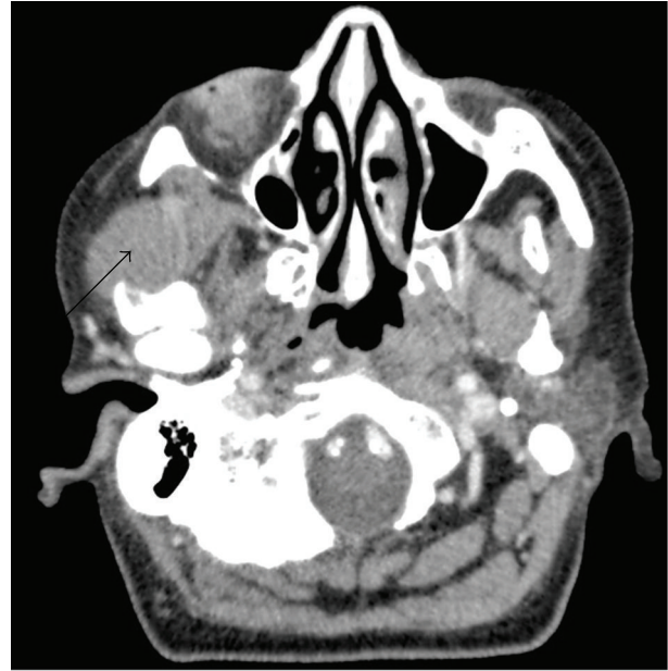
FIGURE 3: CT axial section showing tumour invading right zygomatic arch.

Using a nerve monitor/stimulator throughout, a pre-auricular incision was made and extended up into the hairline with anterior extension along a skin crease. A skin flap was elevated anteriorly and the temporal branch of the facial nerve identified overlying the zygomatic arch. The zygomatic branch was then defined by retrograde dissection. The tumour was found to be pushing up on the underlying fat pad and involving the masseter muscle and zygoma. After anterior mobilization of the facial nerve the involved portion of the zygoma and associated tumour was removed. All