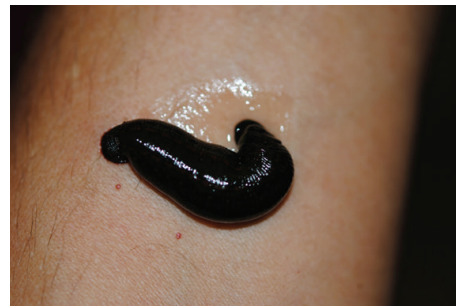
FIGURE 2: Feeding leech: transparent liquid can be seen oozing from the body of the leech.

Depending on the severity and the size of the congestion, 1–10 leeches are used for each treatment, although some authors recommend higher numbers of leeches. The degree of venous congestion is estimated from the percentage of violaceous color of flap skin pedicle, testing capillary refill, and color of the blood oozing from the bite site or after having been pierced with a needle. At the beginning of the treatment, the patient might need two or more treatments per day. Chepeha et al. [29] used a protocol according to which leech placement was continuous (3 leeches per hour) and tapered slowly according to clinical assessment of inosculation. In the Iowa Head and Neck Protocol [30], leeches are applied every 2 hours. The number of treatments per day depends also on the bleeding of previous bite sites. In cases where the bleeding