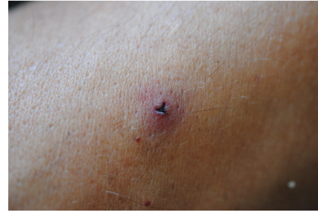
FIGURE 4: Y-shaped leech bite and the surrounding skin reaction.

Signs of regional lymphadenitis, slight swelling, and pain of regional lymph nodes on the side of leech application and subfebrile temperature can occur in 6.4–13.4% of the treated patients and usually appears after 3–4 leech applications. Apparently, such adverse reactions never appear when leeches are applied on oral, nasal, or vaginal mucosa. In very rare cases, allergic skin reactions have been observed. When leeches are applied to the esthetically important areas with thin skin and thin layers of subcutaneous tissue scarring after a leech bite could be a cosmetic problem. In some cases,