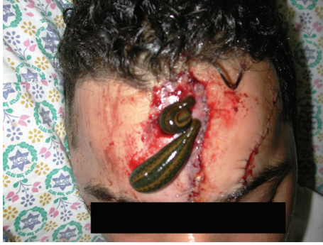
FIGURE 3: Treatment of a skin flap of the face, after removal of the skin with scars and coverage of the area with the enlarged, adjacent skin.

reported from countries such as the USA [15, 22], UK [17], Germany [39], and S. Africa [31].