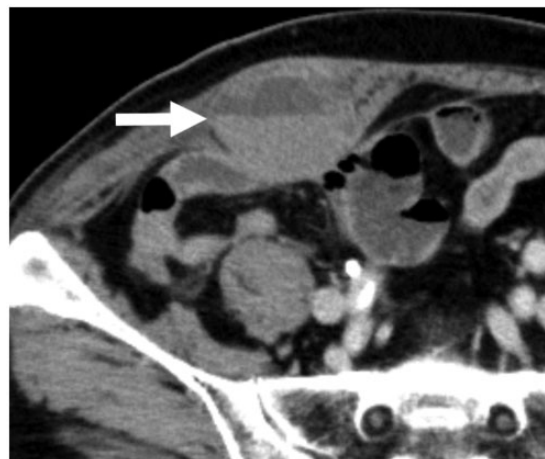
Fig. 1. Fluid level pattern. Axial unenhanced computed tomography shows rectus abdominis muscle hematoma with cellular-fluid level (“hematocrit” sign, arrow).

CT findings of the hematoma. The location of the hematoma was confirmed by multidetector-row CT. First, hematomas were divided into two patterns based on morphological features: those with a fluid level pattern and those with a non-fluid level pattern (Figs. 1 and 2). A fluid level pattern was defined by the presence of single or multiple linear separations caused by the setting of cellular elements in the dependent portion, with the liquid portion in the upper layer of the lesion. A non-fluid level pattern was defined by the absence of linear separations. Morphological changes in hematoma patterns were also evaluated during follow-up CT examinations. Second, hematomas were also classified as being with or without extravasation. Intravenous administration of contrast medium was decided at the discretion of the attending physician depending on the