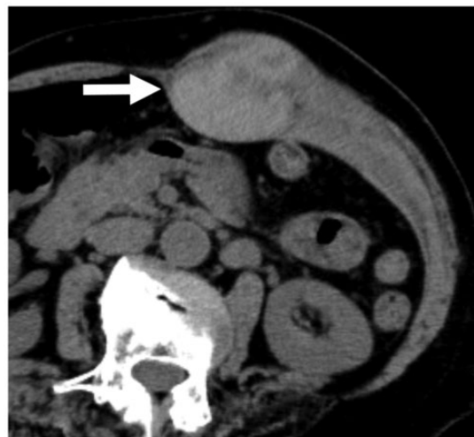
Fig. 2. Non-fluid level pattern. Axial unenhanced computed tomography shows rectus abdominis muscle hematoma, without cellular-fluid levels (arrow).

patient’s condition, and the presence of extravasation was assessed on contrast-enhanced (CE) CT.