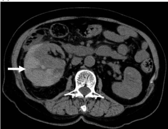
Fig. 3. A 76-year-old woman treated with dabigatran for atrial fibrillation, visited the hospital because of abdominal pain. (a) Axial unenhanced computed tomography showed right perirenal space hematoma, which had no cellular-fluid levels (non-fluid level pattern). (b) On the follow-up CT (two days later), this non-fluid level pattern changed into a fluid level pattern (arrow). CT, computed tomography.