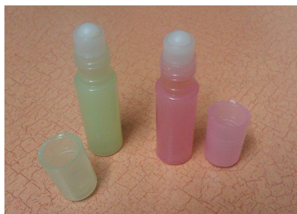
Figure 1. A Photographic Illustration of the Shallomin Roll-on Used in the Study

The method of extraction of shallomin was adopted as previously described (8). In short, 500 g of fresh shallot bulbs (collected from Zagros mountains, 50 km to Dezful City, south of Iran, in spring season; identified by National Chemical Laboratory, Pune, India) were washed thoroughly in water and broken down into small pieces by an electrical grinder, soaked in 500 mL of distilled water for 24 hours, and filtered by Wattman No. 1. The filtrate was mixed with 50% ethyl acetate/water mixture for a further 24 hours. The ethyl acetate fraction was separated and allowed to evaporate under a hood. The precipitate was collected and weighed, and finally, solution of 0.5% in absolute alcohol was prepared and packed in 2 mL roll-on stick containers (Figure 1) and stored in a cool room at 4°C until used.