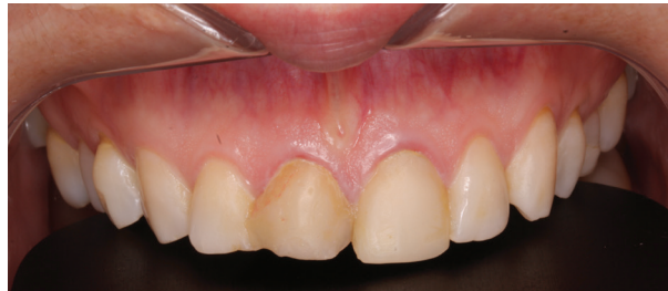
Fig. 2: Initial intraoral picture. The patient presented two composite veneers were discolored, misshapen and showed defective polishing causing irritation of the surrounding soft tissues.

In gingival examination, it could be seen that the gingival zeniths of the upper right central incisor and upper left central incisor lacked a harmonious pattern derived from their apparent asymmetry. To explore the patient's periodontal anatomy, the following parameters were registered (Fig. 3):