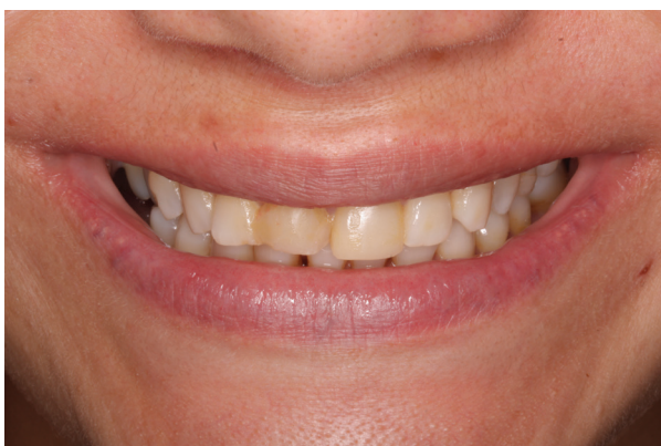
Fig. 1: Initial extraoral picture. The patient presented a low smile line and expressed her dissatisfaction with the esthetics of the upper central incisors.

In clinical examination, the presence of two composite veneers was observed that were discolored and misshapen. In particular, the edge of restoration on the upper right central incisor was bonded to the upper right lateral incisor. Both reconstructions showed defective polishing particularly in the area of the margin causing irritation of the surrounding soft tissues resulting in inflammation and alteration of gingival symmetry at both gingival zeniths. The axial inclination of the right upper central incisor produced an appearance of distortion due to the mesialization of the corresponding gingival zenith, which contributed to the poor esthetics observed (9). (Figs. 1,2)