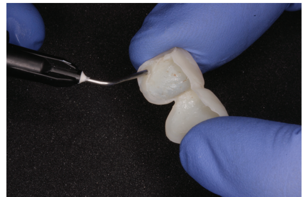
Fig. 6: To fabricate the provisional prostheses, the space between the two margins was filled with flow composite, adapting the shape for to reposition the gingival margin to the correct position.

To fabricate the provisional prostheses, the space between the two margins was filled with FILTEK® SUPREME XTE FLOW flowable composite (3M Espe, Maplewood, Minnesota, USA), to thicken the margin, adapting the shape of the provisional prostheses so that it would reposition the gingival margin to the correct position determined by DSD, wax-up, and now the provisional restorations (Fig. 6). The provisional restora-