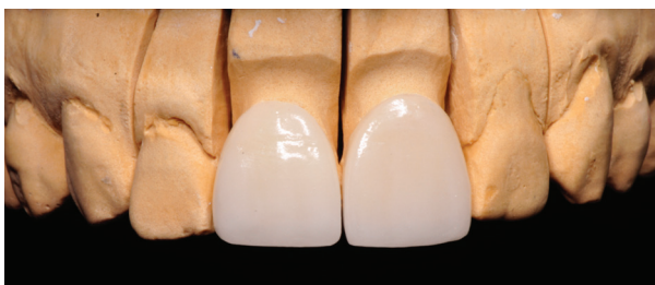
Fig. 9: The laboratory technician used the diagnostic wax-up based on DSD to locate the gingival margin.

The application of ceramic veneers after tooth preparation without finish line, following BOPT concepts as