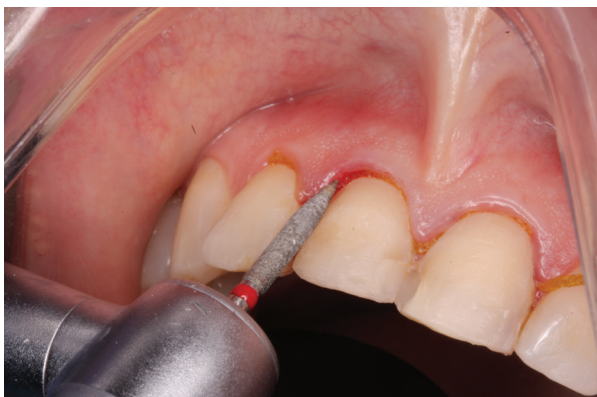
Fig. 5: Dental preparation with BOPT technique. The technique aims to create blood coagulate during preparation that later stabilizes when the provisional restorations are placed.

Dental preparation was performed with help from a silicon index taken from the diagnostic wax-up, preparing the teeth without horizontal finish line, respecting biological width and provoking intrasulcular de-epithelialization according to the BOPT procedure proposed by Dr. Ignazio Loi (5). The technique aims to provoke blood coagulate during preparation that later stabilizes when the provisional restorations are placed and matures to form fully structured gingival tissue (Fig. 5).