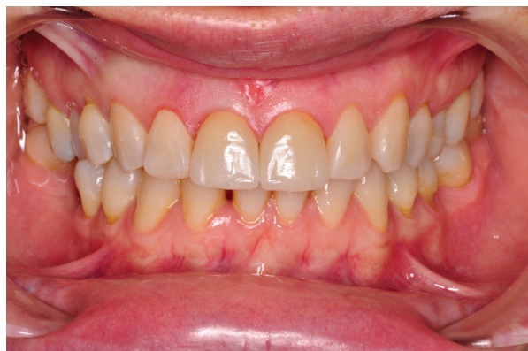
Fig. 12: The restorations are harmoniously integrated both esthetically and periodontally. The integration of the restorations was good thanks to correct soft tissue management.