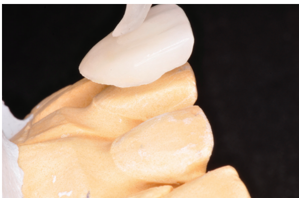
Fig. 10: The feldspathic veneers were ordered to improve the aesthetics of the patient.

proposed by Dr. Loi (5), made it possible to place restorations that were harmoniously integrated both esthetically and periodontally. The chromatic continuity was adequate, the dental proportions, gingival health, the symmetry of the two gingival zeniths were correct and the integration of the restorations was good thanks to correct soft tissue management (15). (Figs. 11,12). At the one-year follow-up visit, the soft tissues had stabilized correctly, and good gingival health was observed despite the correction of gingival asymmetry (5-8) (Fig. 13).