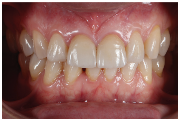
Fig. 13: At the one-year follow-up visit, the soft tissues had stabilized correctly, and good gingival health was observed despite the correction of gingival asymmetry.