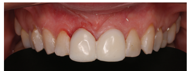
Fig. 7: The provisional restoration were placed leaving the soft tissue to mature.

tions were polished with Sof-lex® disks (3M Espe, Maplewood, Minnesota, USA), their fit was checked in the mouth, and they were placed by means of acid etching and adhesive placed on a small vestibular area of the tooth surface leaving the soft tissue to mature (Figs. 7,8). After 4 weeks, registers were taken using the double cord technique (Ultrapack® #000; Ultradent Products Inc, Köln, Germany) and double mix (Light Body® and Virtual putty®; Ivoclar Vivadent AG, Schaan, Liechtenstein)). To register tooth color, grey scale photogra-