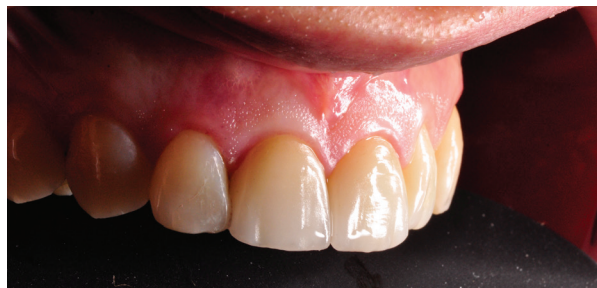
Fig. 11: Finally intraoral picture. The ceramic veneers after tooth preparation without finish line, following BOPT concepts.

proposed by Dr. Loi (5), made it possible to place restorations that were harmoniously integrated both esthetically and periodontally. The chromatic continuity was adequate, the dental proportions, gingival health, the symmetry of the two gingival zeniths were correct and the integration of the restorations was good thanks to correct soft tissue management (15). (Figs. 11,12). At the one-year follow-up visit, the soft tissues had stabilized correctly, and good gingival health was observed despite the correction of gingival asymmetry (5-8) (Fig. 13).