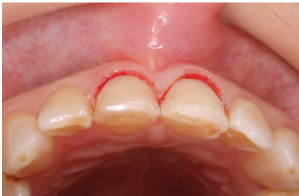
Fig. 8: After 4 weeks the soft tissue are mature in the correct position.

phs were taken to determine the tone, and conventional feldspathic veneers were ordered for the right upper central incisor and left upper central incisor. To fabricate the veneers, the laboratory technician used the diagnostic wax-up based on DSD (created before tooth preparation) to locate the gingival margin (Figs. 9,10). Once fabricated, the restorations were assessed by two clinicians before being cemented in place.