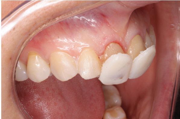
Fig. 4: When placed de mock-up on the teeth we see the mark that produces the resin and we observe that it is not necessary to invade the biological width as there was sufficient margin from the gingival margin to the bone crest.

On the basis of the information obtained, a treatment plan was decided, consisting of two feldspathic veneers on the upper central incisors as well as a direct composite restoration on the upper right lateral incisor.