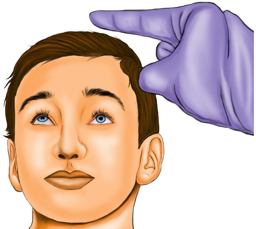
FIGURE 1: Left-sided WEBOF in a child. Note that the left eye exhibits restricted upward gaze (suggesting inferior rectus muscle entrapment) and there are no signs of external soft tissue trauma.

A literature review revealed that WEBOFs are more prevalent in the pediatric population and are commonly overlooked in the ED. Moreover, there is a correlation between early surgical intervention and a favorable outcome [4-7]. Although WEBOF is more common in pediatric patients (Figure 1), it can also occur in adults. Ethunandan and Evans reported seven cases of WEBOFs, of which one was a 29-year-old [8]. Mehanna et al. reported a 21-year-old man with WEBOF that underwent surgery six days after the injury [9]. This patient continued to have extraocular muscle paresis, despite satisfactory postoperative computed tomography of the maxillofacial bones (CTMF). Therefore, WEBOFs can occur in the adult as well as pediatric population, and early surgical management may play a crucial role in both age groups.