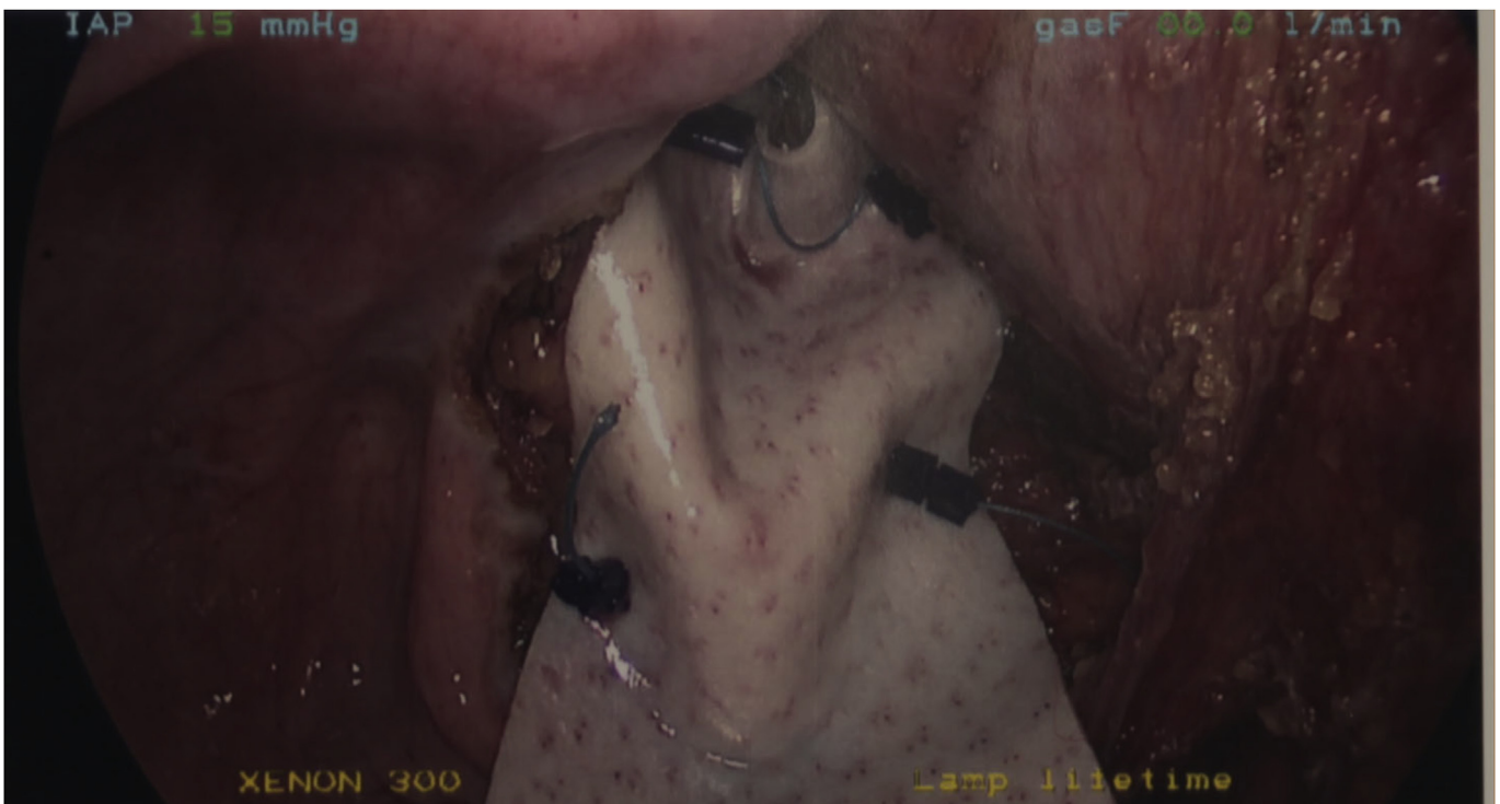
Fig. 3. Step 1 and 2 are repeated few centimetre above to complete proximal row of sutures.

anesthetic techniques [7]. Laparoscopic VMR has gained popularity over last decade as a safe alternative technique and is associated with very low morbidity [1]. In the medium term, it provides good result for prolapse and associated symptoms. The suturing is difficult with current laparoscopic instruments as instruments are