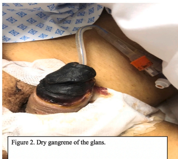
Figure 2. Dry gangrene of the glans.