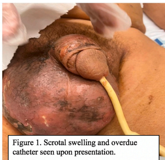
Figure 1. Scrotal swelling and overdue catheter seen upon presentation.