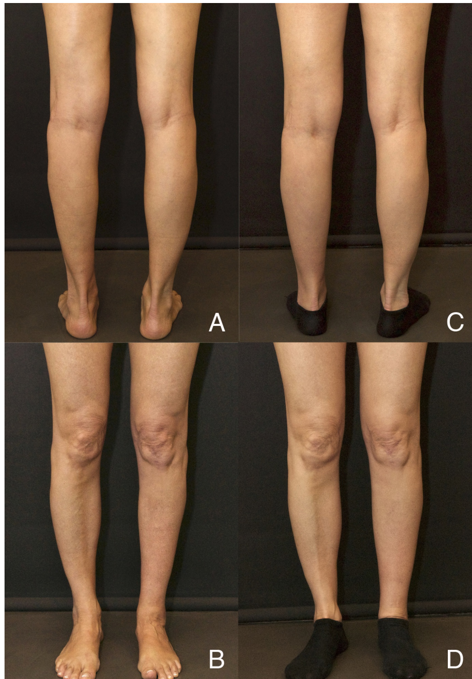
FIGURE 4: Case 3

(A, B) Preoperative views of Case 3; (C, D) Postoperative views 15 months after single cell-enriched fat grafting session.