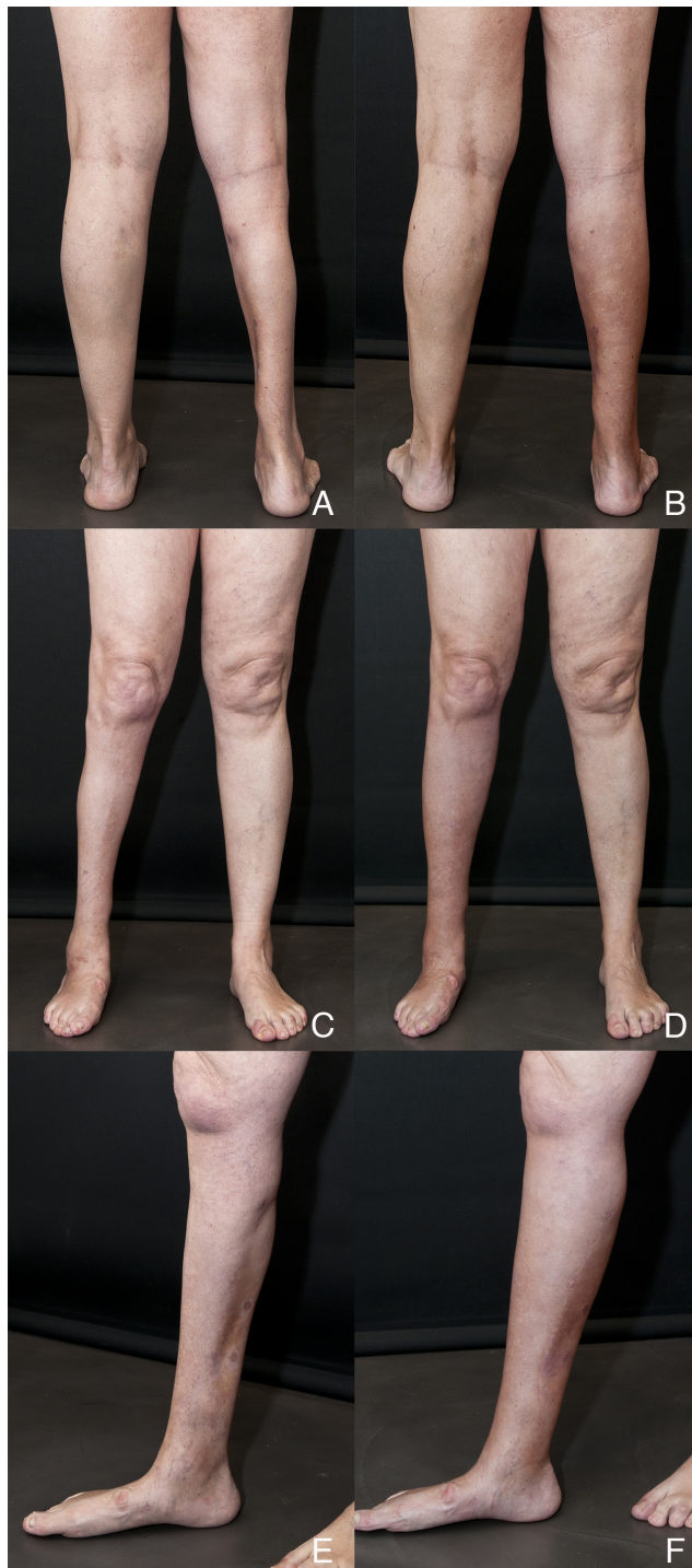
FIGURE 3: Case 2

(A, C, E) Preoperative view of Case 2; (B, D, F) Postoperative views 12 months after second session.