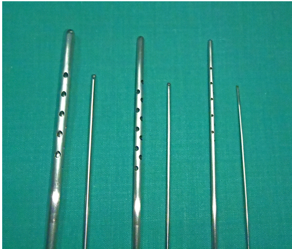
FIGURE 1: Collecting and injecting cannulas used by the author.