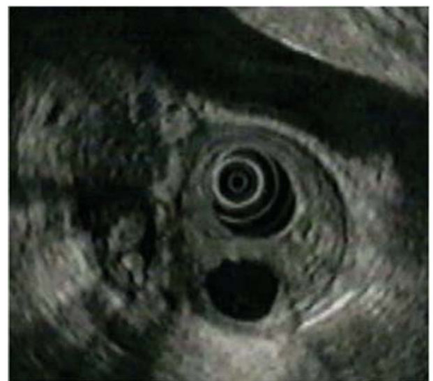
Figure 3. Cyst and thickening of duodenal wall on echoendoscopy.

Following the endoscopy, the clinical condition of the patient continued to deteriorate due to persistence of gastrointestinal bleeding, with hemodynamic instability, which required further blood transfusions. Finally, the surgery service