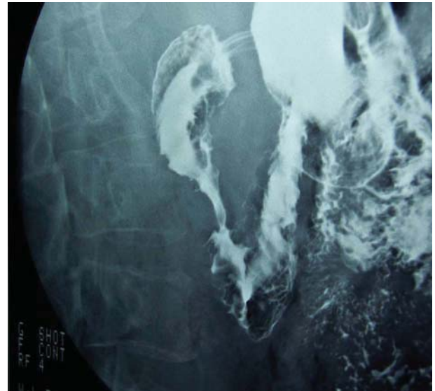
Figure 2. Gastric and duodenal dilatation is seen prior to stenosis in the second part of the duodenum.

During his stay in hospital the patient's condition worsened due to a progressive deterioration in his nutritional status, which required parenteral nutrition, and due to an episode of gastrointestinal hemorrhage, associated with hemodynamic instability, which required supportive measures (intravenous fluid therapy, blood transfusion) and emergen-