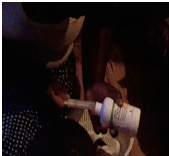
Figure 2. Dose measurement of 3TC taken at an angle. The image illustrates the caregiver of a suppressed child on ART taking a measurement of 3TC at a horizontal angle.

underutilised amongst the caregivers (only used 15 times across 56 observations) (Table 2). Observation revealed that syringe nozzles were used more frequently by caregivers of children newly initiated (observed six times) and suppressed on ART (observed seven times) compared to unsuppressed children on ART (observed twice). Fewer instances were observed among those with unsuppressed VLs as a large proportion was receiving LPV/r via syringe only.