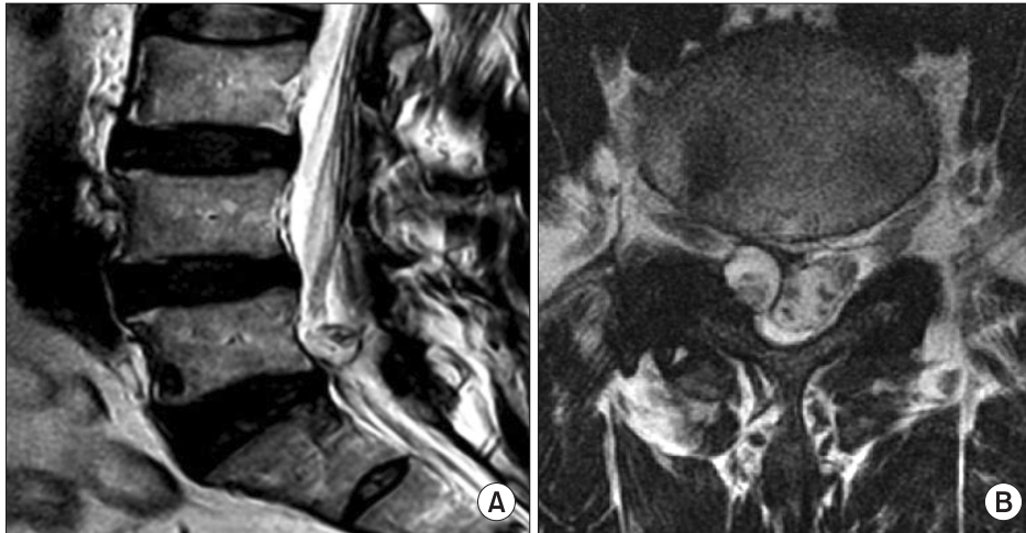
Fig. 1. This figure shows the sagittal and axial magnetic resonance images of the lumbar spine. The proton-weighted sagittal image of the lumbar spine (A) demonstrates the presence of a large mass at the level of the lower part of the L5 body. In the T2-weighted axial view (B) the mass appears to be medial to the facet joint. A peripheral zone of calcification surrounds the mass. The central lucency might be air or fat. The appearance is compatible with a synovial cyst arising from the facet joint.