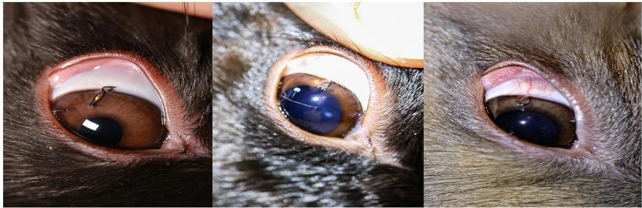
Figure 5: Bevacizumab Group: 7th, 21st and 42 nd Days of Study; Significant Less Progression of Area and Length of CNV in 42nd Day of Study Compared to Control and Propranolol Groups