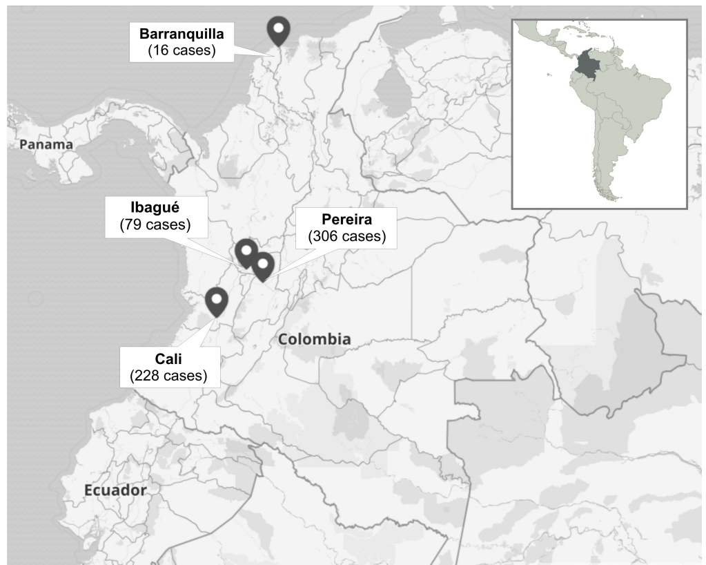
FIGURE 1: Distribution of cases of anophthalmia in four cities of Colombia

Around 63% (n=321) of the cases belonged to male patients, with an age range of six months to 90 years and an average age of 43.4 years for 455 cases that registered the patient's age. Approximately 52% of cases were above 40 years' old and around the fourth part of the data belonged to patients over 60 years' old, which indicates a greater occurrence of anophthalmia as age increases, for the analyzed records (Table 1). Bilateral anophthalmia was described in 14 cases and the unilateral disease was presented without big differences between the right and left eyes.