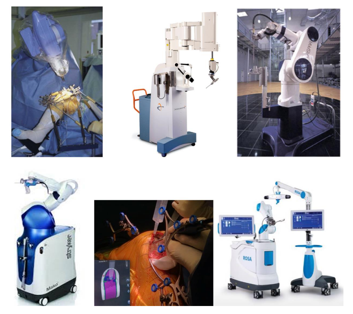
Figure 4. The autonomous and semiautonomous robotic systems incorporate safeguards against removal of bone beyond the 3D plan. The first three robotic systems are autonomous (Robodoc, Caspar). The last three robotic systems are semiautonomous (Mako, Navio, Rosa).

Three categories of robotic systems for knee arthroplasties exist: passive, semiautonomous, and autonomous robotic systems. A passive system provides a 3D virtual model, which allows accurate preoperative planning. But there is no system to prepare the bone. The autonomous and semiautonomous systems incorporate safeguards against the removal of bone beyond the 3D plan (Figure 4).