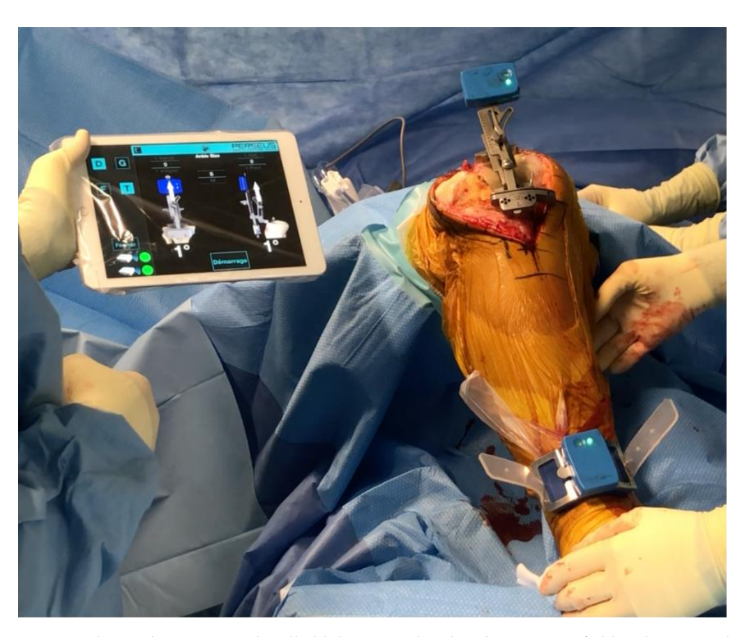
Figure 3. The accelerometer is a handheld device used within the operative field to determine the resection planes of the proximal tibia. This system guides resection angles in the coronal and sagittal planes (Perseus, Orthokey).