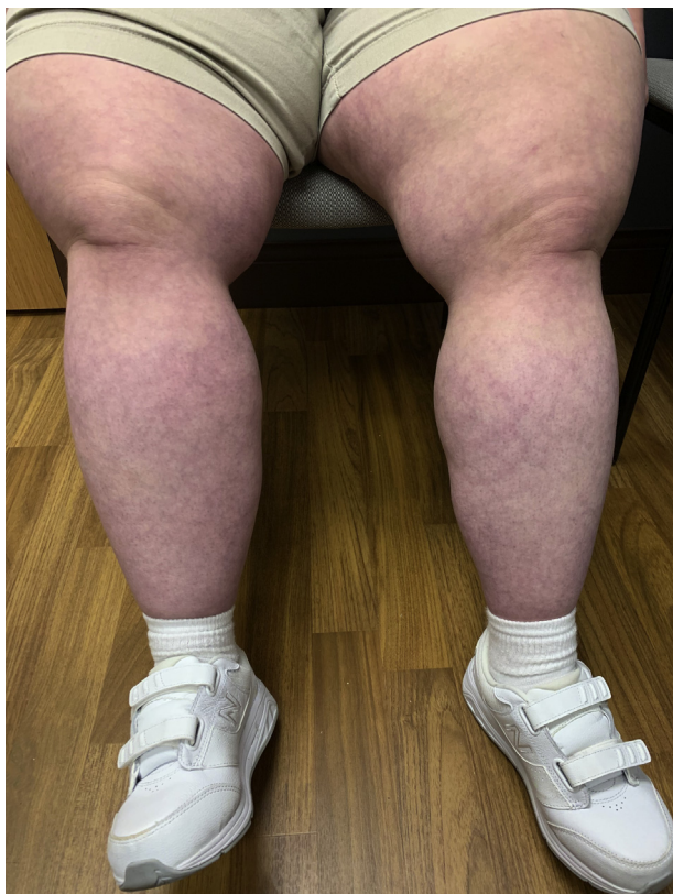
Fig 5. Postoperative clinical image of patient with resolution of acute edema and phlegmasia.

and edema had resolved significantly, and at 1- and 3-month follow up, she was completely asymptomatic with normal findings on venous duplex ultrasound (Fig 5).