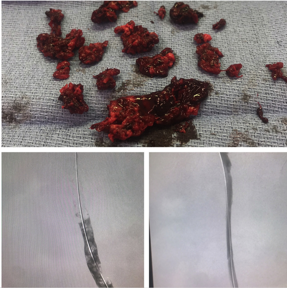
Fig 4. Ascending venogram of right lower extremity (prone position) before and after percutaneous thrombectomy with demonstrated thrombus burden.

was performed, demonstrating complete thrombosis of the femoropopliteal and iliofemoral segments. The patient was then systemically anticoagulated with heparin with a target activated clotting time of >250 seconds.