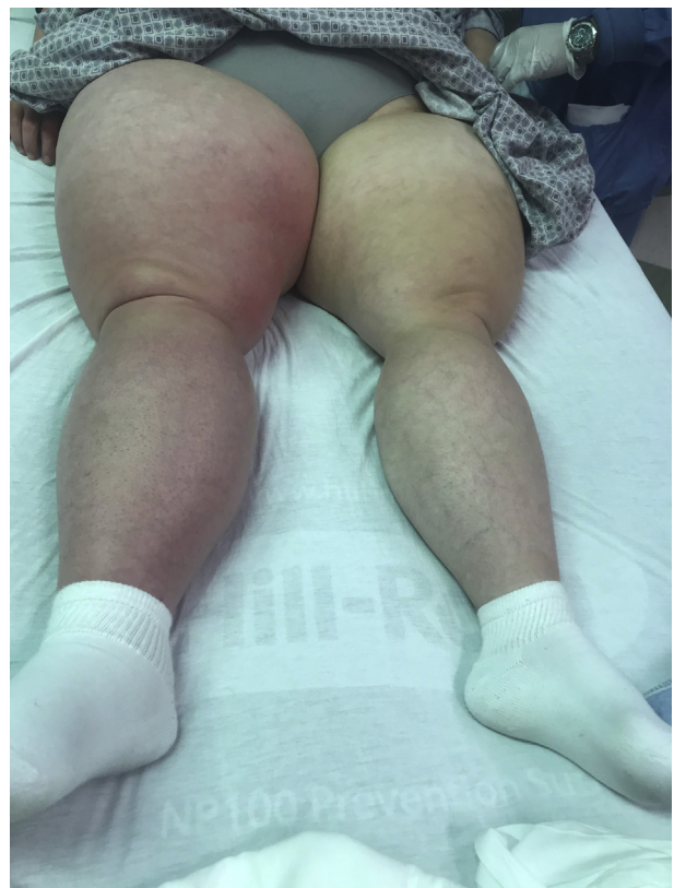
Fig 1. Acute extensive right lower extremity edema and phlegmasia cerulea.

A 29-year-old white woman with Down syndrome and mild cognitive impairment presented to her primary care physician with a 1-day history of acute right lower extremity edema extending from the proximal thigh to the level of the foot and associated pain described as continuous, severe, and throbbing. Venous duplex ultrasound examination demonstrated extensive occlusive thrombus extending from the right external iliac vein to the infrapopliteal veins. She was then transferred to our