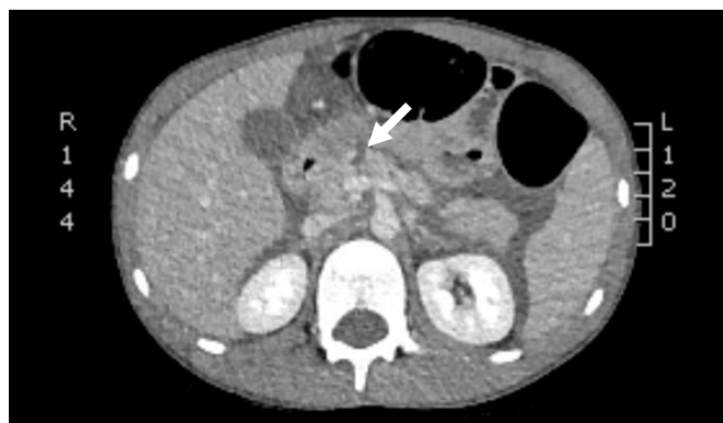
Fig. 2. Postcontrast computed tomography imaging with arrow pointing to the site of pancreatic transection.

Upon reviewing the USS report, an urgent computed tomography (CT) scan of the patient's abdomen and pelvis was requested for a more detailed evaluation. The CT scan revealed a pancreatic transection accompanied by a moderate volume of retroperitoneal and intra-abdominal free fluid (Fig. 2). Additional findings included thickening in the gastric pylorus region, likely due to the adjacent pancreatic injury, and a normal appendix (Fig. 3). Consequently, the child's abdominal discomfort was indeed caused by pancreatic injury resulting from the previously mentioned blunt abdominal trauma sustained during the quadbike