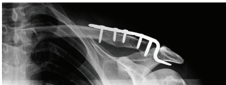
FIGURE 2: Initial hook plate fixation of distal clavicle.