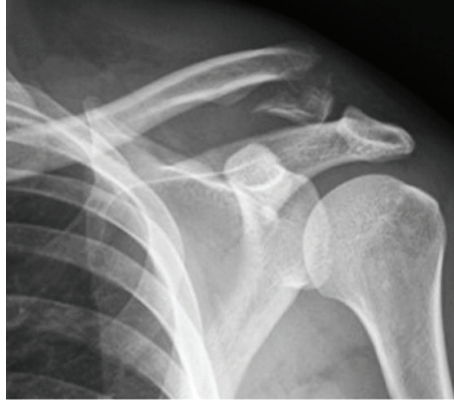
FIGURE 1: Initial radiographs prior to osteosynthesis.